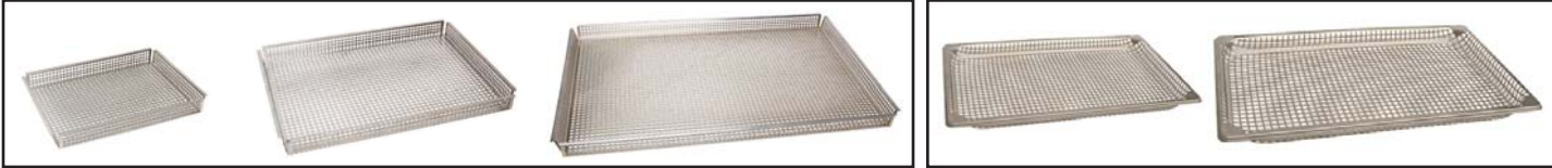
COB-Q: Oven Basket (Quarter Size) COB-H: Oven Basket (Half Size) COB-F: Oven Basket (Full Size) GRH018: Oven Fry Basket (Half Size) GRF018: Oven Fry Basket (Full Size)