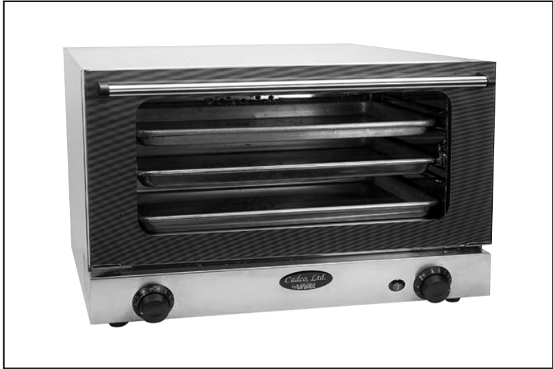
Model OV-350 - Countertop convection oven has 2 modes: regular baking and finishing