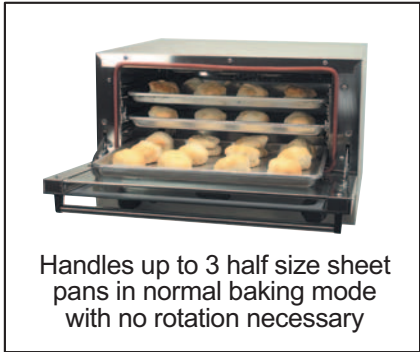
Handles up to 3 half size sheet pans in normal baking mode with no rotation necessary