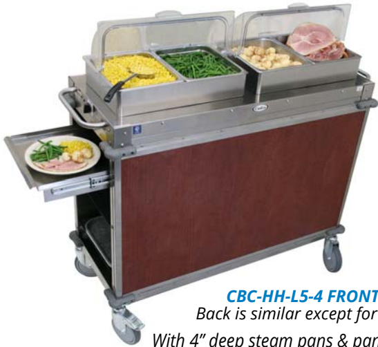
CBC-HH-L5-4 FRONT; Back is similar except for cord With 4" deep steam pans & panholders

Model Variations include: 2-1/2" or 4" deep steam pans, & stainless OR Wilsonart® Contract Laminate panels in a selection of colors. (4" deep pans NOT meant for use with meats unless only filled halfway)