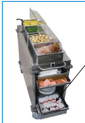
Side views: Total of 4 drawers & 3 shelves