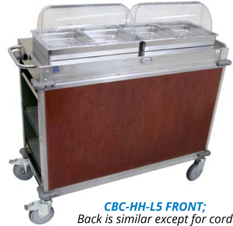
CBC-HH-L5 FRONT; Back is similar except for cord With 2-1/2" deep steam pans & panholders