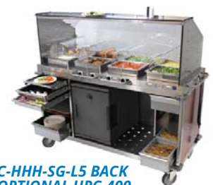
CBC-HHH-SG-L5 BACK w/ OPTIONAL UPC-400

SS-49 - Safety Shield for 3-Bay Carts ● To prevent diners from touching hot top of cart surface ● Stainless