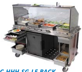
CBC-HHH-SG-L5 BACK w/ OPTIONAL UPC-400

SS-64 - Safety Shield for 4-Bay Carts • To prevent diners from touching hot top of cart surface • Stainless